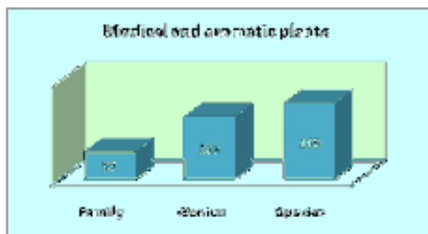
Figure 2. The floristic biodiversity of medicinal and aromatic plants in the Lumbardh valley

genera and 155 species representing, medicinal and aromatic plants (Figure 2). From the analysis of life forms, based on the classification of the Danish botanist Raunkier (1934) dominate the species from H-Hemicryptophyta 61 species, Ph- Phanerophyta 45 species, T- Terophyta 23 species, G-Geophyta 13 species, Ch-Chamaephyta 12 species, Linaceae 1 species.